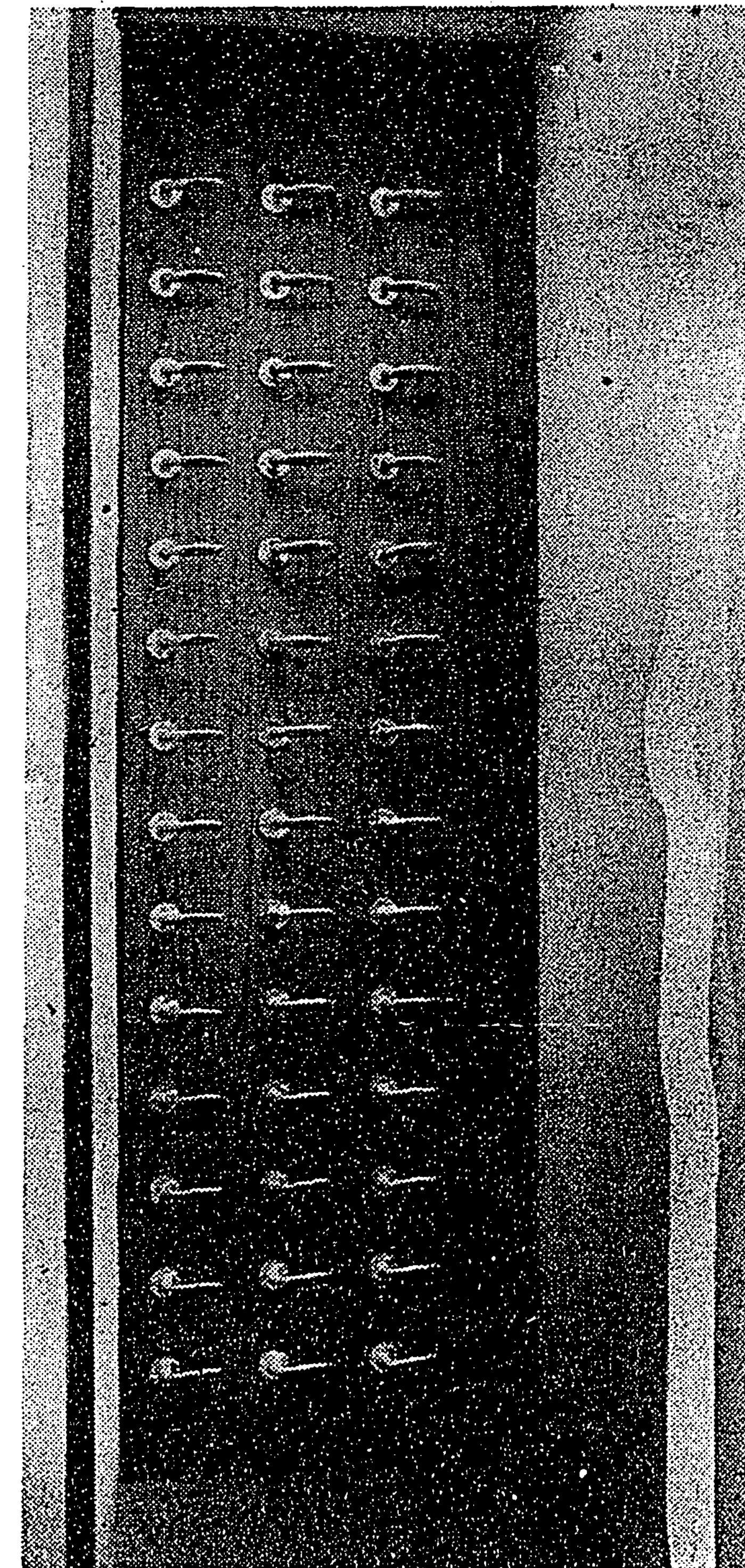
If you can't open Hans Hollein's "Frustration Door," there's an escape hatch in wall at right.